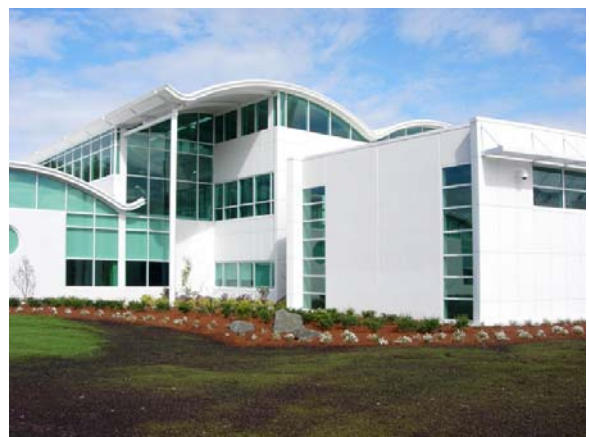
Royal Caribbean Cruise Lines Eugene, OR

grand rapids 4448 shiloh pines se grand rapids, mi 49546 t.616.901.7512 f.616.825.6298