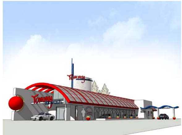
Car Wash Prototype