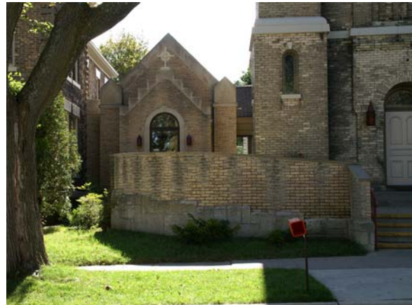
New Annex for Guardian Angels Church Manistee, MI