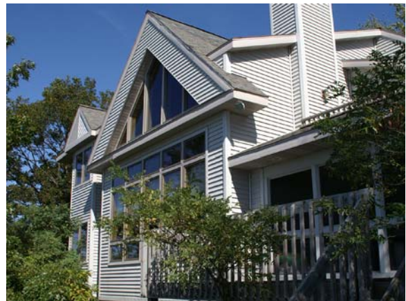
Private Residence Pentwater, MI