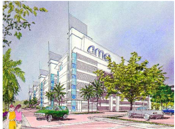
Fashion Mall Plantation, FL

Concessions Stand for Stearns Park Ludington, Michigan