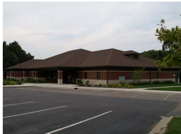
Office Building for District 10 Health Department Ludington, MI