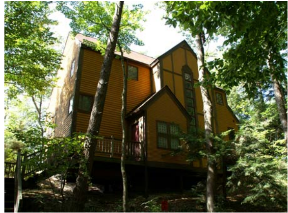
Private Residence Pentwater, MI

Private Cottage W. Sunset Bay Road Ludington, Michigan