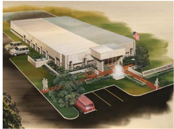
Aquatic Systems Inc. Ludington, MI

Mortgage Lenders Network (MLN)*** Wallingford, Connecticut