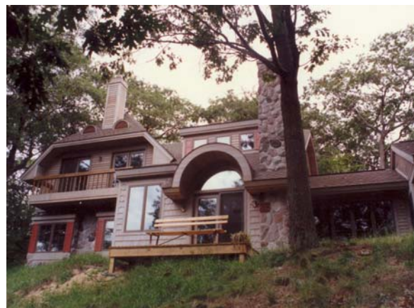
Private Residence Ludington, MI

New Parish Hall for St. Stanislaus Parish Ludington, Michigan