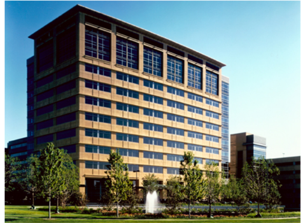
Pointe O'Hare Chicago, IL

The R2 Design Group is committed to this approach and is demonstrated by our ability to complete our clients' ideas and fulfill their expectations.