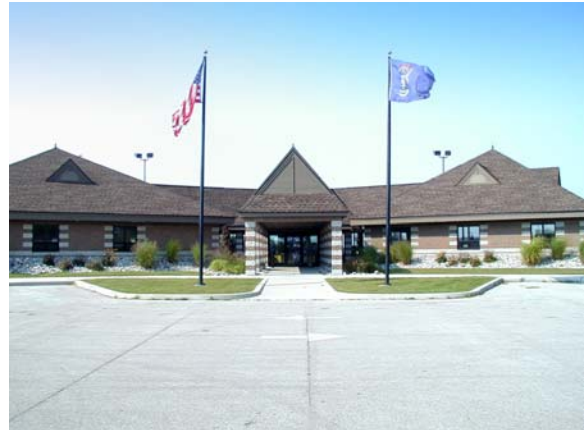
Mason County Airport Terminal and Civic Office Center Ludington, MI

As part of the complete architectural package, we design corporate identity graphics packages that encompass exterior and interior signage, identification graphics, directional signage, logos and a range of collateral materials. These graphics mirror the form and aesthetics of the facility itself.