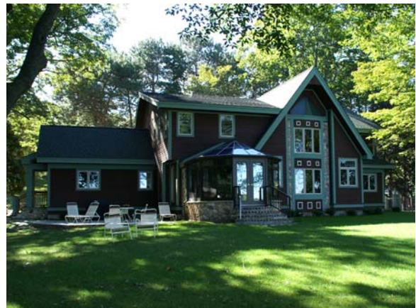
Private Residence Ludington, MI

grand rapids 4448 shiloh pines se grand rapids, mi 49546 t.616.901.7512 f.616.825.6298