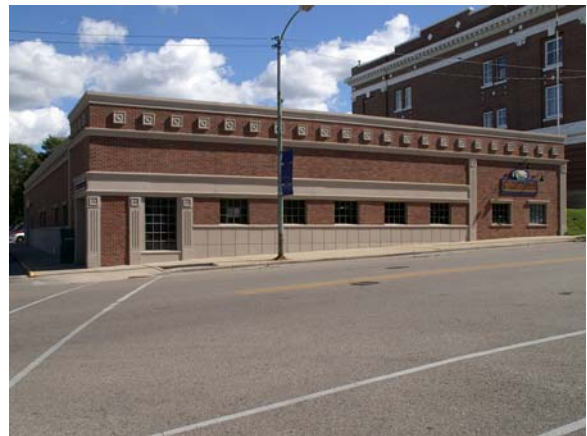
Manistee News Advocate Manistee, MI

grand rapids 4448 shiloh pines se grand rapids, mi 49546 t.616.901.7512 f.616.825.6298