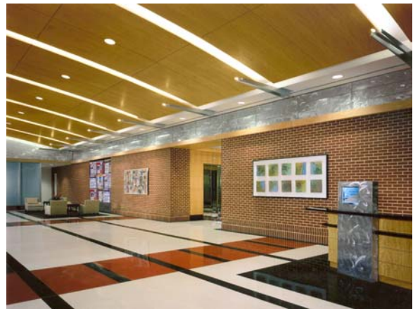
Millennium in Midtown Atlanta, GA