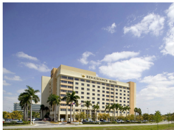
Renaissance Hotel Tampa, FL

grand rapids 4448 shiloh pines se grand rapids, mi 49546 t.616.901.7512 f.616.825.6298