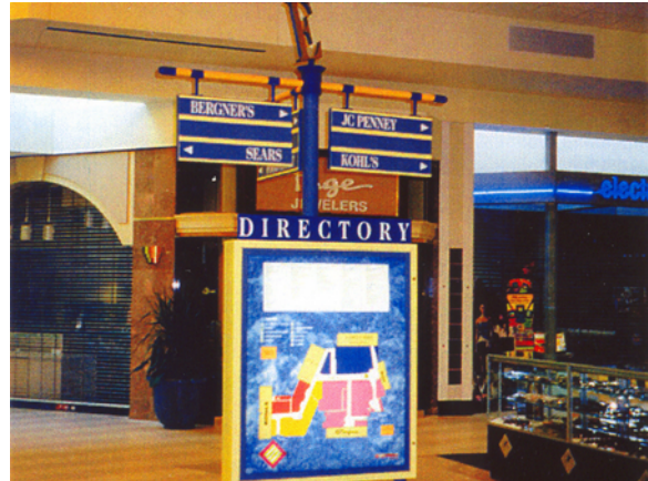
Eastland Mall Bloomington, IL