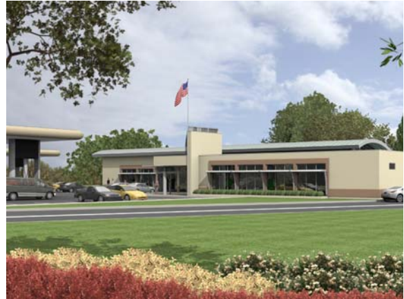
Convenience Store and Car Wash Naples, FL

Fire Station for Lake Missaukee Fire Authority Lake City, Michigan