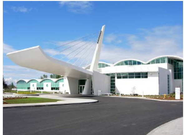
Royal Caribbean Cruise Lines Eugene, OR