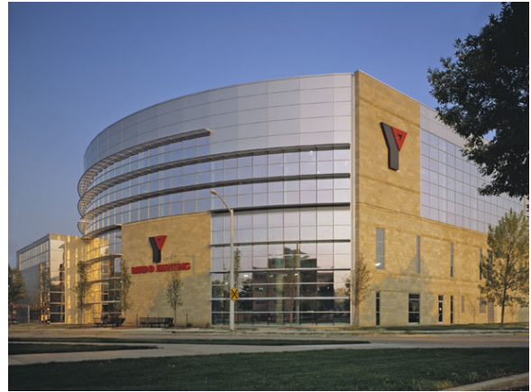
David D. Hunting YMCA Grand Rapids, MI

The R2 Design Group looks forward to sharing our philosophy and experience with you.