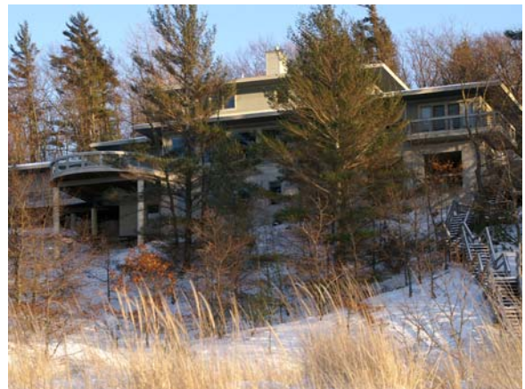
Private Residence Pentwater, MI

grand rapids 4448 shiloh pines se grand rapids, mi 49546 t.616.901.7512 f.616.825.6298