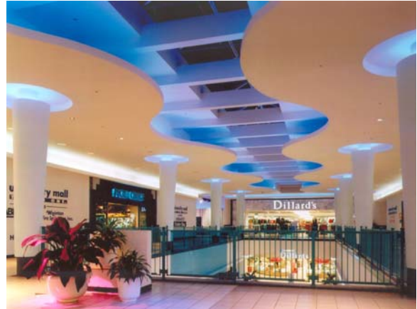
University Mall Tampa, FL

Northpointe Centre – Northgate Furniture and Appliance*** Holland, Michigan