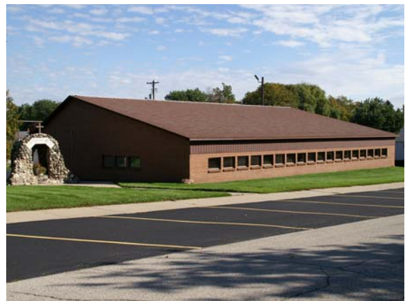
New Parish Hall for St. Stanislaus Parish Ludington, MI

grand rapids 4448 shiloh pines se grand rapids, mi 49546 t.616.901.7512 f.616.825.6298