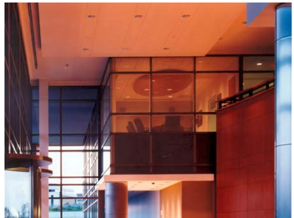
Pointe O'Hare Chicago, IL

grand rapids 4448 shiloh pines se grand rapids, mi 49546 t.616.901.7512 f.616.825.6298