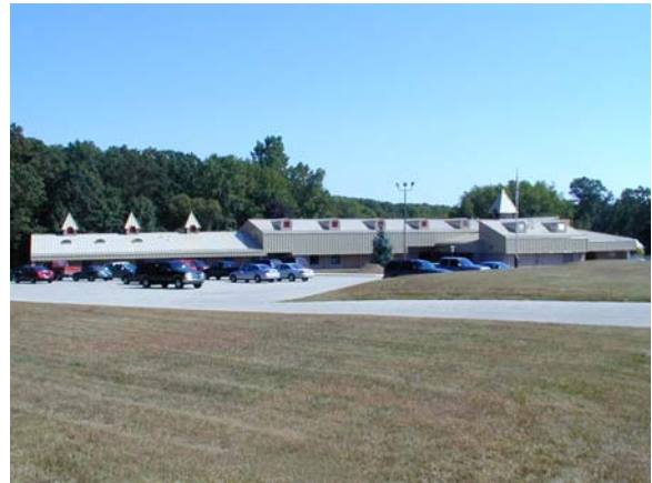
Neway Center Newaygo, MI