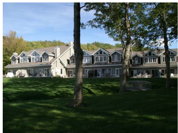
Woodland Acres Condominiums Onkama, MI

grand rapids 4448 shiloh pines se grand rapids, mi 49546 t.616.901.7512 f.616.825.6298