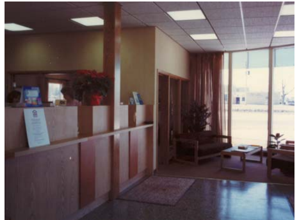
Shelby State Bank Rothbury, MI

Bilingual Community Academy*** Washington D.C.